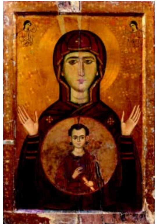
Icon with the Virgin Blachernitissa Byzantine, 13th century Tempera and gold on wood, canvas and mixed media Monastery of Saint Catherine, Mount Sinai