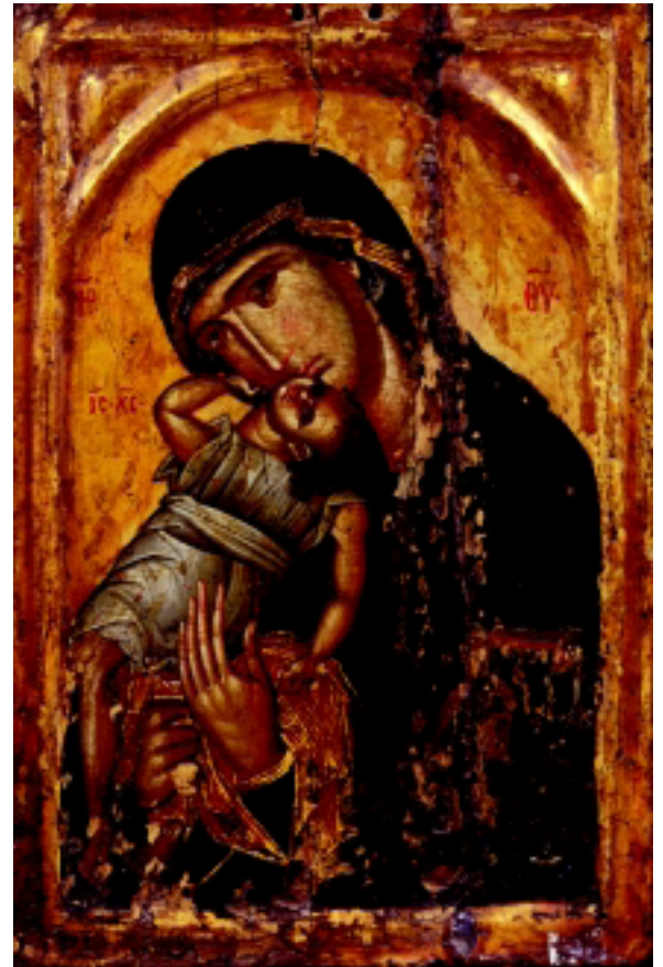
Icon with the Virgin Pelagonitissa Byzantine, early 15th century Tempera on gessoed linen over wood Monastery of Saint Catherine at Mount Sinai