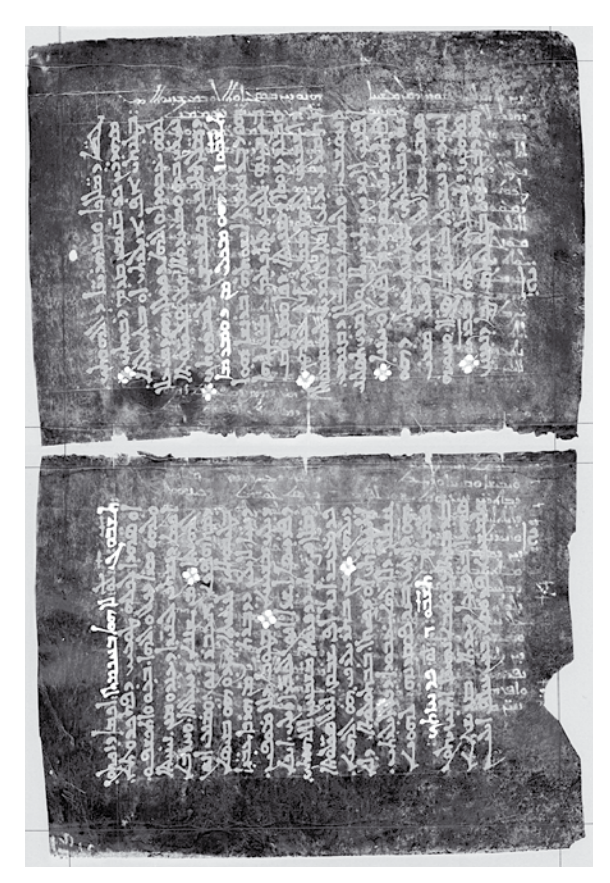
2 SGP, fol. 117r-124v, CVA processed. The end of Book Two and the pinax (list of chapters) of Book Three.

It is a well-known fact that anybody interested in the Sinai manuscripts in a particular language (Greek, Syriac, Arabic, Georgian, Slavonic and so on) must take into consideration not only the old collection and the New Finds, unearthed in 1975, but also a third group, the diaspora manuscripts, manuscripts once kept at the monastery but now dispersed. This third group is the most elusive in terms of exact numbers and location. Many diaspora manuscripts were apparently removed illicitly, and their actual whereabouts are not always easy to ascertain. Sadly, the library of Saint Catherine's, celebrated for its exceptional holdings, has become nearly as well known for the manuscripts that are no longer there. The famous Codex Sinaiticus (now British Library Add. 43725) takes pride of place among them.