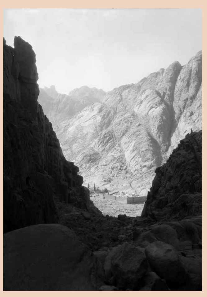
Sinai. Panoramic view. Photograph by Fred Boissonnas, 28 May 1933 Roussen Collection

Actual size not shown Both cards measure a generous 22 by 15.5cm (8 ^2 /3 by 6 inches)