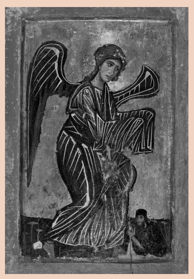
Icon with the Archangel Michael Tempera and gold on panel, early 13th century, Sinai Monastery of Saint Catherine, Mount Sinai