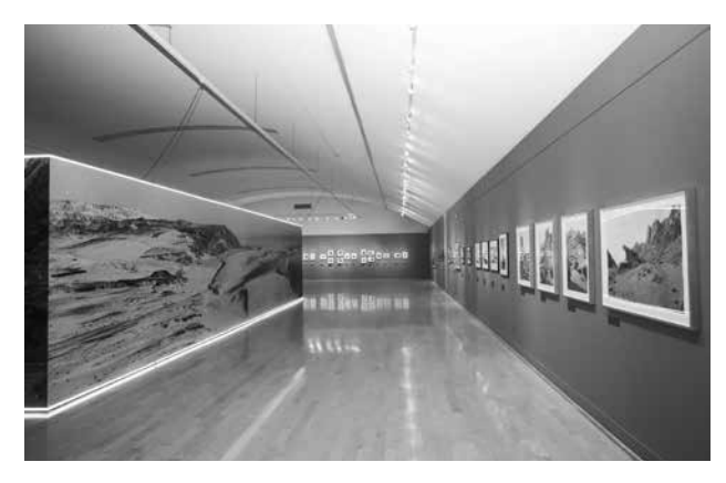
The exhibition installed.