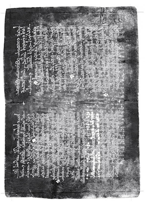
1 SGP, fol. 120r-121v (On Simple Drugs, Book Three), CVA processed. The quire signature waw (six) can be seen bottom right.