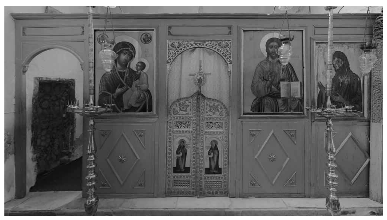
Chapel of the Holy Fathers Slaughtered at Sinai and Raithou.

Nevertheless, it should be noted that modern historians have a hard time accepting the martyr narratives of Ammonius or Ps.-Nilus as factual accounts. Ps.-Nilus's Narrations is patently modelled on Fourth Maccabees and conventions of Hellenistic romance, but the Ammonius Report is even more suspect. It purports to be a straightforward, eyewitness, fourth-century traveller's account that was later found in Egypt by a priest who translated it from Coptic into Greek. However, such claims of eyewitness testimony, chance discovery and subsequent translation are common to forgeries in antiquity. There are other reasons to doubt its historical credibility. Besides the sheer implausibility of its claim that an identical number