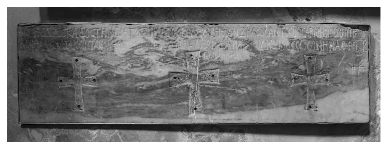
The Saint Catherine's martyr inscription.

Visitors admiring the splendours of the basilica church at Saint Catherine's Monastery might easily pass the small rectangular room located along its southwest side (illustrated opposite). Known as the 'Chapel of the Holy Fathers Slaughtered at Sinai and Rhaithou', it is a relatively humble space, featuring few decorations apart from its green iconostasis. Inserted in its back wall, however, is a small (0.91 x 0.25 m) grey and white slab of marble bearing three indentations that once held iron crosses (pictured at the top of the page). Above this, on the marble, an attentive visitor will discern two faint lines of Greek. Inscribed with letter forms that indicate a late sixth- or early seventh-century date, the inscription reads: