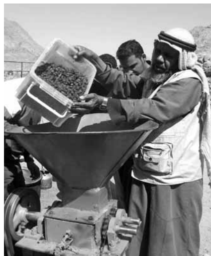
Seventy families now use the mo'assessa's oil press.

However, the 2011 Revolution also revolutionized the mo'assessa's operation, expanding our work and its impact. In the liberalized climate of the Arab Spring we ran community meetings in 75 locations across South Sinai,