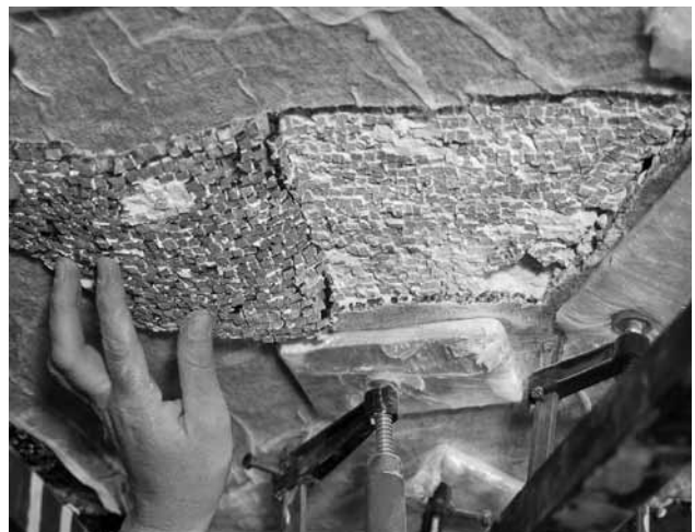
The conservators opened a rectangular section of the mosaic at the apex of the apse to inspect the condition of the granite.

The work of consolidation took three years to complete. It was performed in progressive stages after periods of rest and continuous verification. Once the injected mortar had dried, we returned to add more consolidant to areas where voids remained. However, the centre of the mosaic required a different approach. From the attentions of Father Samuel, we knew that the problem here was already serious in 1847. And from the American intervention starting in 1958, we knew that the monk's efforts had not resulted in a permanent solution. We were afraid that there might be a crack or defect in the granite at the apex of the apse. To investigate further, we decided to open a rectangular 20-centimetre section of mosaic in the area of gold tesserae next to Christ's face. We covered the section with two layers of cotton gauze and cut on three sides to create a 'hinge', which enabled us to lift the gauze-covered section without removing it. Underneath we found red bedding typical of the background for gold tesserae. Once we had covered the bedding layer in gauze, we deepened the cut and lifted the bedding layer as well, finally arriving at the granite itself.