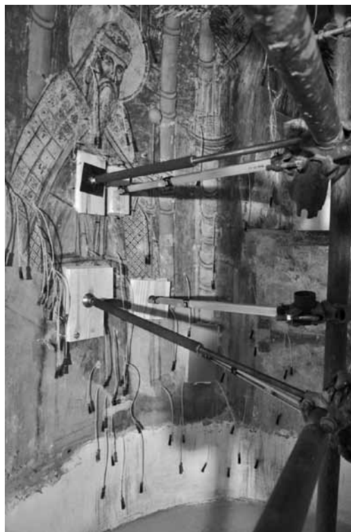
Chapel of the Prophets Moses and Aaron: preparation for grouting.