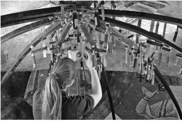
The 'spider' supported the mosaic during consolidation work.

metal terminating in telescoping supports. Completely separate from the scaffolding, the spider was anchored directly to the walls of the church and the base of the mosaic, providing a framework that allowed props to be applied as needed to any part of the mosaic. Had we attached the props to the scaffolding, the vibrations would have been dangerous for the mosaic and detrimental to the proper adhesion of the consolidant. Before beginning the conservation treatment proper, and parallel to the task of documentation, we secured all the detached sections of the mosaic with props attached to the spider. This enabled us to work calmly and safely throughout the treatment process.