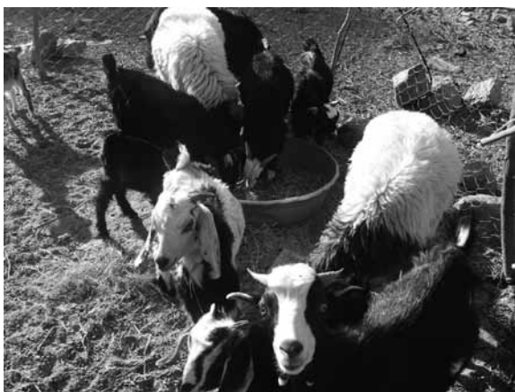
A typical small mixed flock.

ranges, extended families moving frequently with their few material goods and easily dismantled tents woven by women from their own wool. Detailed knowledge of different wadis and elevations, each with its characteristic vegetation and water supply, was used by Bedu to maximize benefits from their surroundings. Taking the flocks out to pasture was traditionally a job for women and girls, and the wadis around St Katherine would be filled, morning and evening, with the sound of bleating, chatter and laughter as the girls walked their charges to pasture.